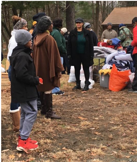
We worked with another nonprofit to add shoes, gloves, hats, blankets, and clothing to their outreach efforts.