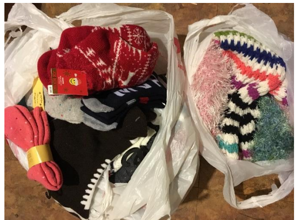
Socks, scarfs, and hats for children and women.

This is one of my favorite items to give away.