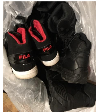
Leather sneakers help fight off the cold in the winter.

Before we set out for a delivery, we ensure the vehicles are filled with as many boxes and bags of shoes and clothing as possible. If we find there's an empty spot, we fill it.