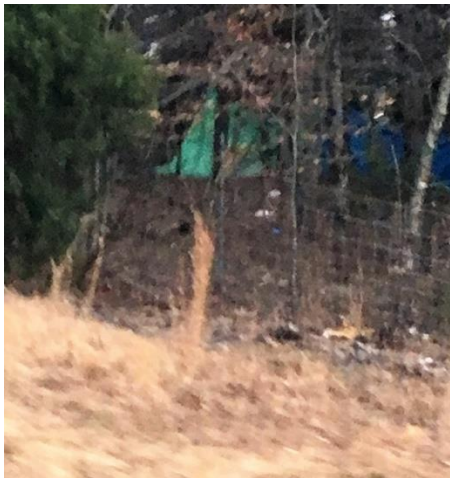
A Tent City along the I95 corridor in Prince William County, VA.

Prince William County, Virginia , is considered a relatively affluent county, yet ‘Tent Cities’ have developed in some of their wooded areas. The tents are visible to commuters as they zoom up and down Interstate 95 each day. Men and women move into the woods and live in tents. They brave the cold temperatures in the winter and the oppressive heat in the summer. Some of the people who live in the woods have jobs and others are looking for jobs. Others are down on the luck and have no place else to go. All face desperate times and a difficult economy. These ingredients have created unlikely bonds of friendship.