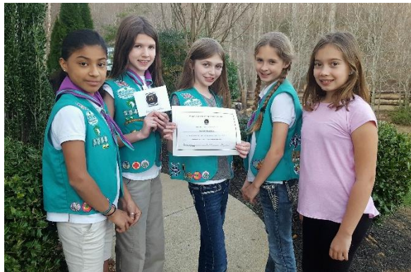
Pictured: Some of the Girl Scouts posing with a Thank You card and Appreciation Certificate from The JDF for their volunteer work.

February, March ushered in blue skies, early Cherry Blossoms and snow! Leave it to the Leprechauns, 4 leaf clovers and good ole' St. Patrick to keep March exciting. As we prepare to celebrate St. Patty's Day, we want to share how our dear friends, these adorable Girl Scouts, partnered with The JDF and spread a lot of love in February.