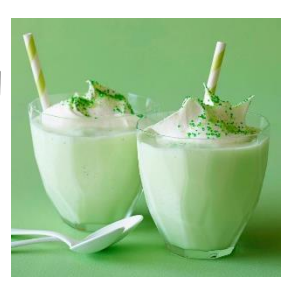
St. Patrick's Day Mint Shake