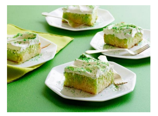
St. Patrick's Day Lime Poke Cake

Wow! These will really turn your menu into an Irish feast! Enjoy!