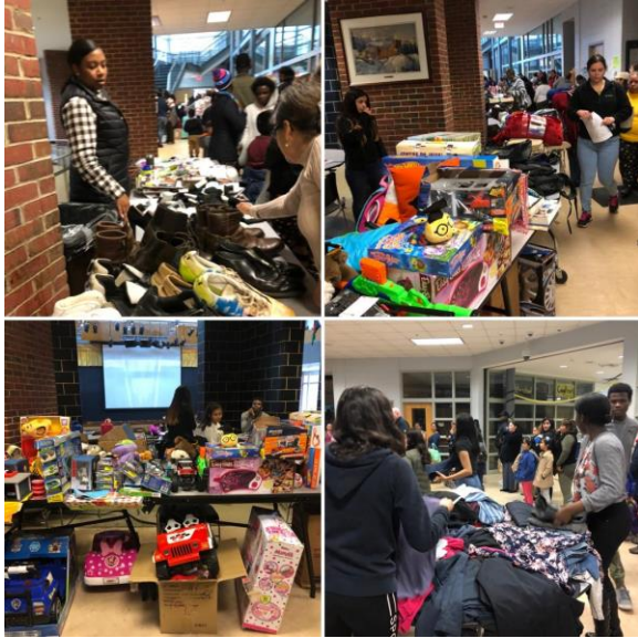
Capital Area Food Bank Family Market

Virginia, the District of Columbia, Georgia and Arkansas in three weeks. With Christmas still more than two weeks away, our teams are moving full speed ahead.