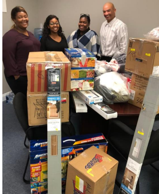
Embrace Foster Care delivery

ensure a group of Virginia foster families had goods for their upcoming holiday celebration. Within 48 hours, we met that need with toys, clothing, and products for nearly three dozen families. The goods we provided will allow the kids to 'shop' for their siblings and family members.