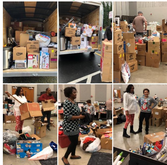
Delivery and set up of goods for VA

Our mission has grown! After three years of striving to meet the foot health needs of the homeless and underserved, The JDF mission has broadened to incorporate and fulfill new opportunities. Partnering with the largest retailer in the country has equipped us with valuable goods for financially challenged families. Effective immediately, The JDF mission now promotes "foot health and healthy lifestyles for the underserved." Our Health Fairs have also evolved. We continue to focus on