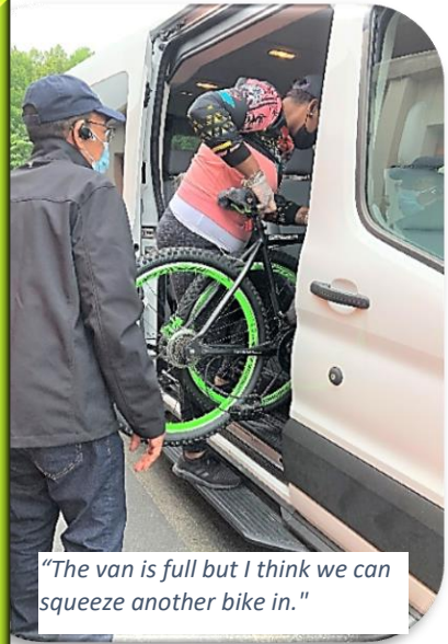
"The van is full but I think we can squeeze another bike in."

We gave away microwaves, cleaners, vacuums, personnel products, clothing, blankets, sheets, kitchenware, baby goods, toys, shoes, and so much more to help those in need during the COVID19 crisis.