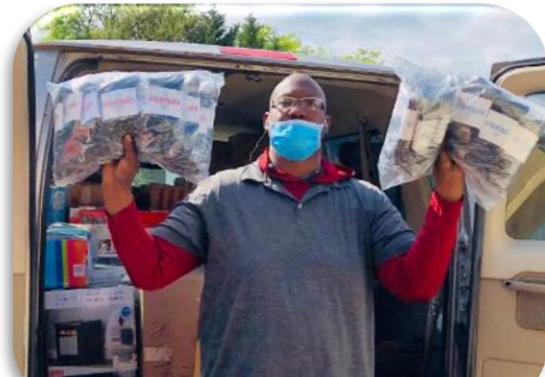
Our new friend from Urban Outreach holding up socks.

health never wavers so of course, each of our deliveries includes the Bombas socks that everyone loves!