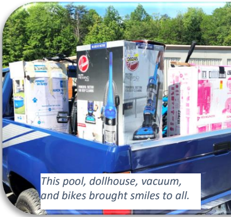
This pool, dollhouse, vacuum, and bikes brought smiles to all.

We gave away microwaves, cleaners, vacuums, personnel products, clothing, blankets, sheets, kitchenware, baby goods, toys, shoes, and so much more to help those in need during the COVID19 crisis.