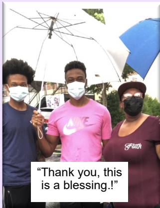
"Thank you, this is a blessing.!"

We are also proud of The JDF recipients of the 2021 President's Volunteer Service award. Eleven of our JDF volunteers cumulatively donated 3,415 hours of service. JDF volunteers rock!