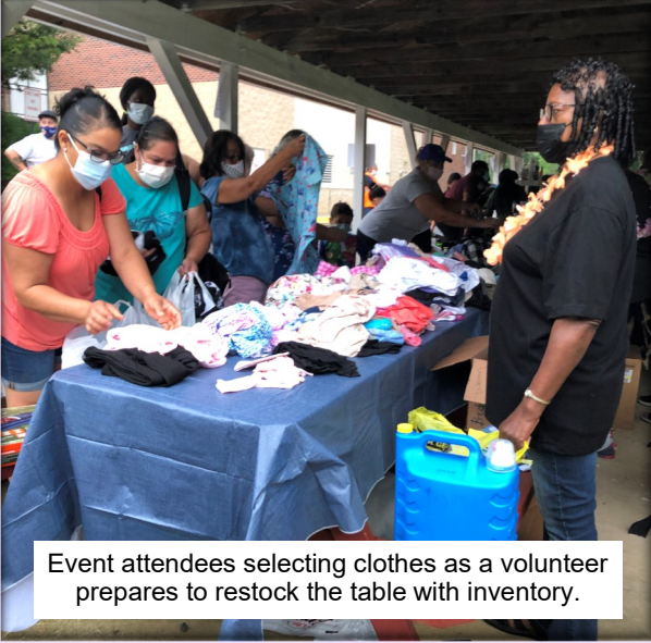
Event attendees selecting clothes as a volunteer prepares to restock the table with inventory.

Promoting foot health and healthy lifestyles for the underserved.