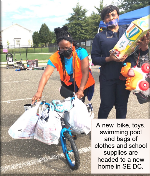
A new bike, toys, swimming pool and bags of clothes and school supplies are headed to a new home in SE DC.

Promoting foot health and healthy lifestyles for the underserved.