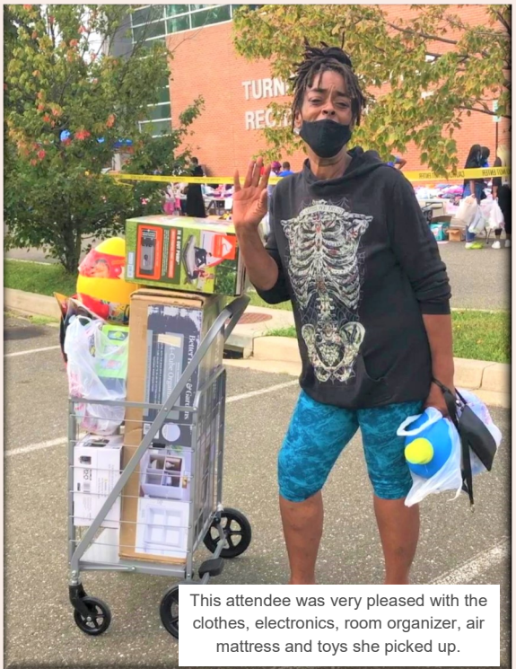
This attendee was very pleased with the clothes, electronics, room organizer, air mattress and toys she picked up.

We commemorated the 20th anniversary of 9/11 by serving others and bringing smiles. Partnerships with Turner Learning Center, New Image Community Baptist Church and the Office of the Attorney General ATTEND program helped us make new friends and bring thousands of dollars of goods to those in need.