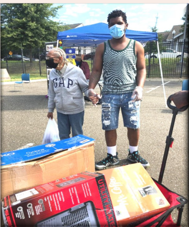
Pictured on the left is a senior citizen being gently escorted towards her wagon filled with a heater, fan and coffee maker.

Neighbors aged 2 to 92 came out to pick up goods they needed to help them live healthier lives. Attendees had more than twenty tables filled with goods to select from. New shoes, socks, clothes, electronics, bikes, vacuum cleaners, blenders, Pampers, paper goods, vaporizers, Halloween costumes, toys, school supplies, and a wide assortment of household goods were distributed. Volunteers from New Image, the AOG's ATTEND Program and The JDF worked for hours to bring this event to the SE DC community. Turner volunteers joined in the fun and provided additional school supplies for the kids. We look forward to working with our new partners, and seeing our new friends again.