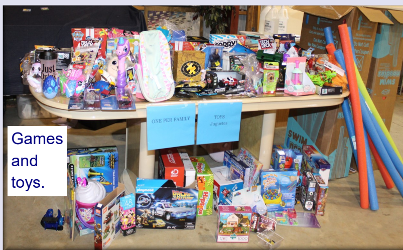
Games and toys.