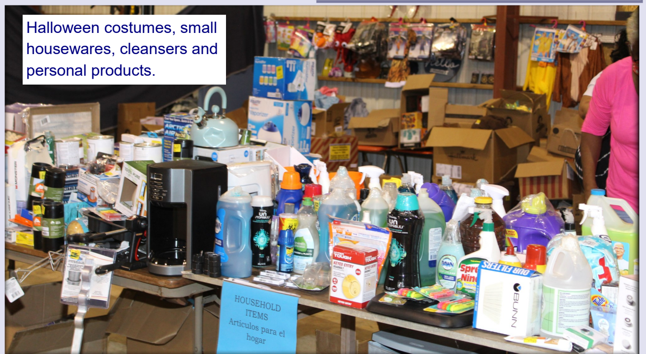
Halloween costumes, small housewares, cleansers and personal products.