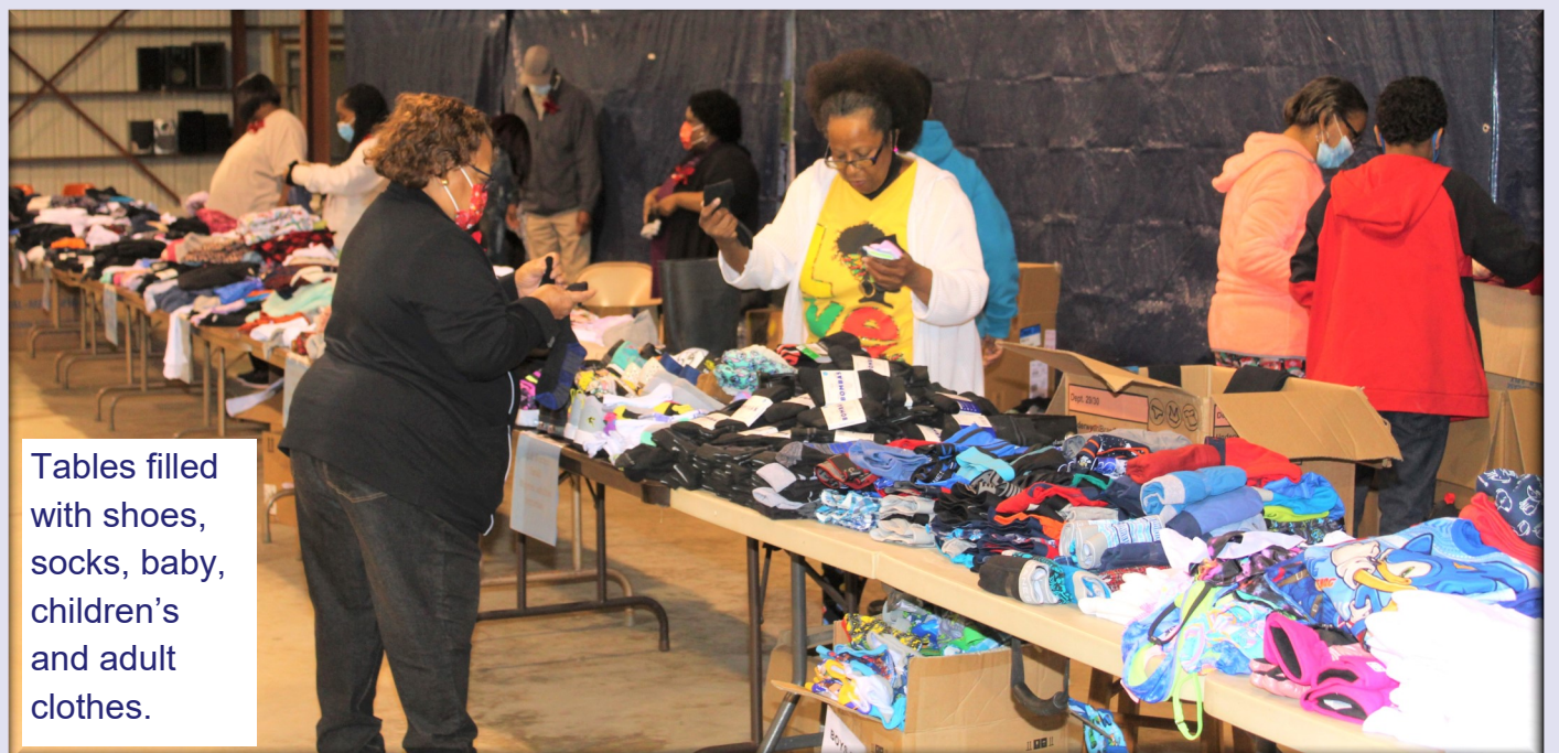
Tables filled with shoes, socks, baby, children's and adult clothes.

Squeals of delight from the children and exclamations from awestruck adults filled the room. For the Buckingham community, Christmas 2021 truly was the most wonderful time of year.