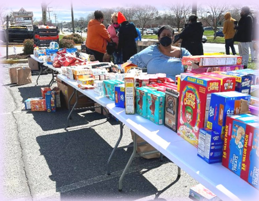
Volunteers setting up a food table,