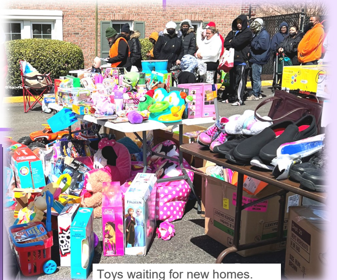
Toys waiting for new homes.