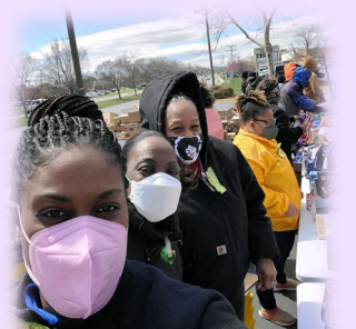
Eastern Star volunteers.