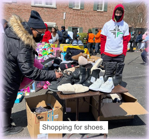
Shopping for shoes.

Promoting foot health and healthy lifestyles for the underserved.