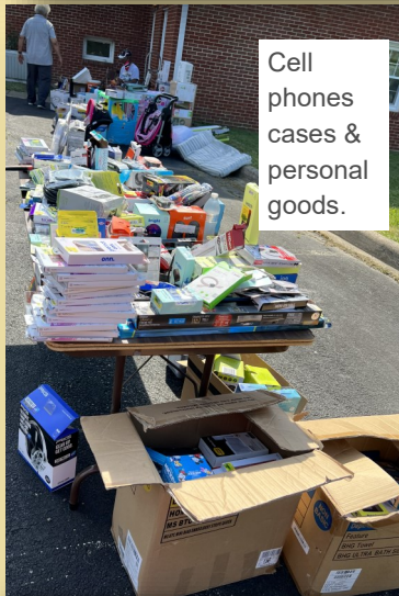
Cell phones cases & personal goods.