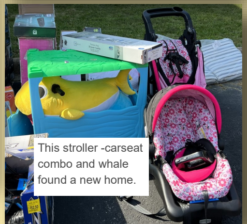
This stroller -carseat combo and whale found a new home.