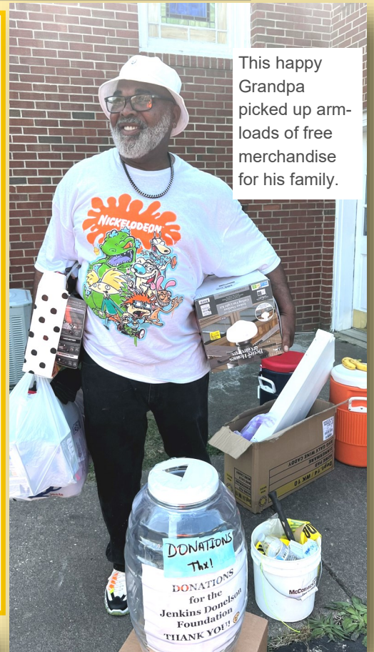
This happy Grandpa picked up arm-loads of free merchandise for his family.

The attendees lined up before the event started and they all left carrying bags and boxes of merchandise. Shoes, socks, clothes, baby goods, toys, sports nets, household goods, personal products, holiday goods, school supplies, and lots more found new homes with happy new owners. We had fun on a sizzling hot day!