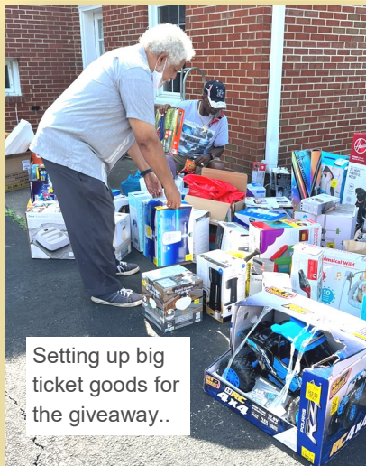
Setting up big ticket goods for the giveaway..