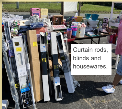
Curtain rods, blinds and housewares.